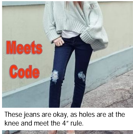
These jeans are okay, as holes are at the knee and meet the 4" rule.