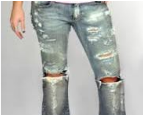
The holes in these are too high on the thigh.

Again, the above mentioned items are not new. We thank you for partnering with us in this matter.