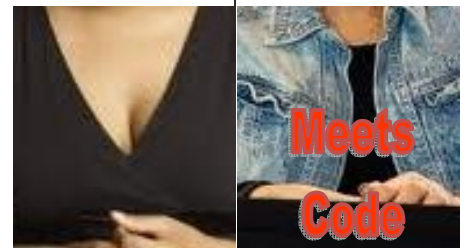
This neckline meets the modesty guideline.