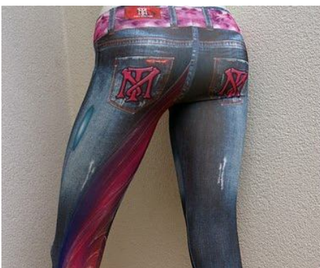
This is an example of Jeggings. Cotton pants that are tight fitting are also prohibited unless worn with a shirt, skirt, or shorts that meet the 4" rule.